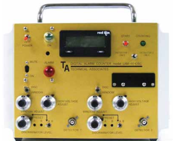
PRS-7-DSC NEX-BETA Electronics

The concentration and total activity released and MDA levels are continuously calculated and recorded. All data can be saved to the hard drive in spreadsheet format.