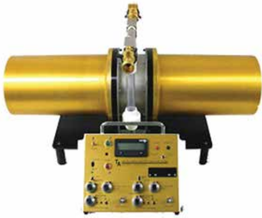
Reliable NEX-Beta Detector and PRS-7-DSC Electronics